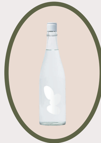
Ohmine 3 Grains 4 oz $15 | 12 oz $40 | 720 ml $75

VISIT SUMIAOHUNAN.COM FOR PICK UP | DELIVERY | RESERVATION