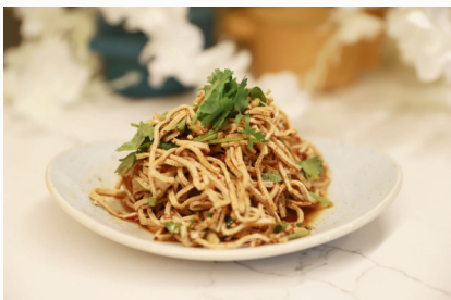
Cold Shredded Beancurd 凉拌豆干丝 $12