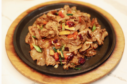
Hot Kiss 铁板香辣牛舌 $38