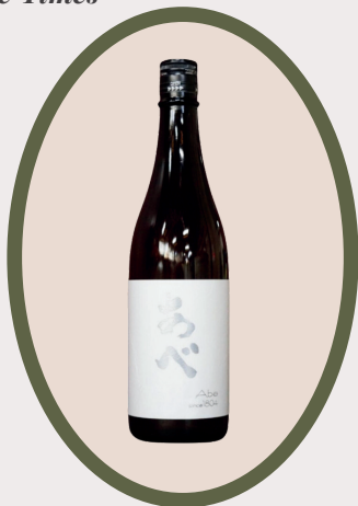
Abe Shuzo Junmai Ginjo 4 oz $18 | 12 oz $50 | 720 ml $105

"Ohmine Shuzou is an Innovative sake producer in Yamaguchi that came back after 50-year hiatus"