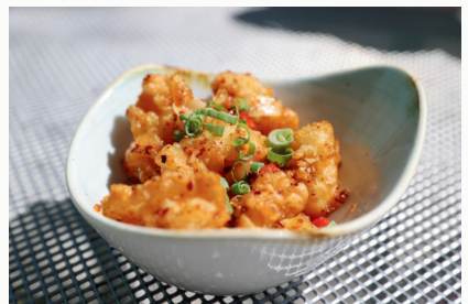
Garlic Calamari 蒜香鱿鱼卷 $16