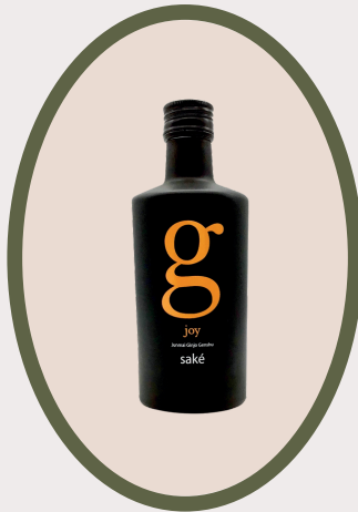
G Joy Sake 300 ml $28