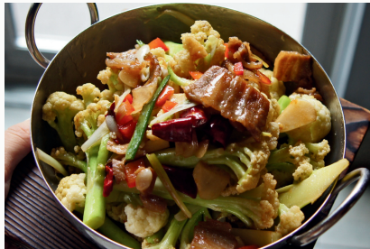
Spicy Cauliflower 干锅香辣花菜 $22