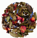
Peach White Tea 桃甘白茶

Carefully sourced, simply enjoyed. SINCE 1999