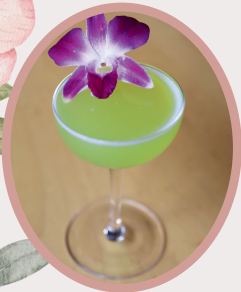
Baijiu Blast 白酒浪 $14