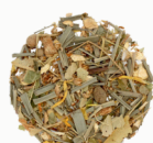
Ginger Lemon* 姜香柠檬茶