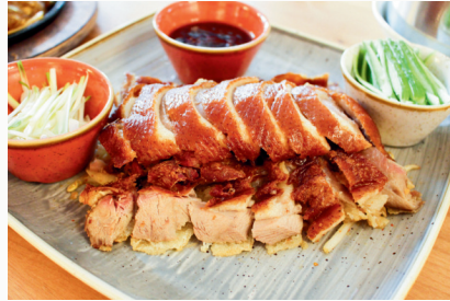
House Crispy Duck 本楼香酥烤鸭 $42