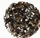
Pu-Erh Mao Cha 普洱毛茶