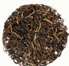
Golden Monkey Black Tea 金骏眉黑茶