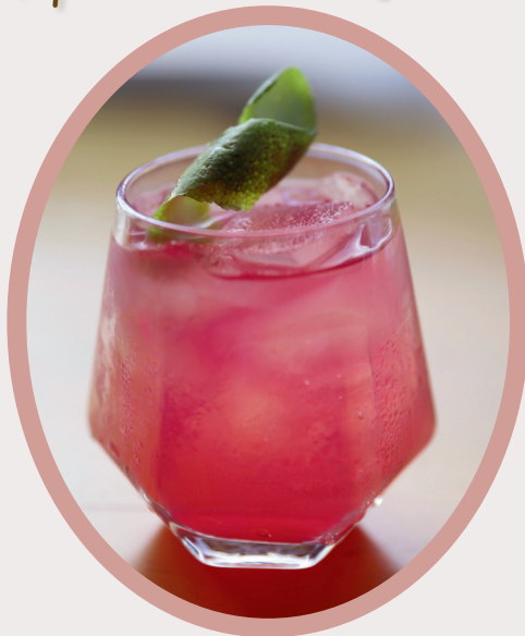
Red Ruby 红宝石 $14

Baijiu, Rum, Prickly Pear Lime, Cinnamon