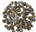
Jasmine Green Tea 茉莉绿茶