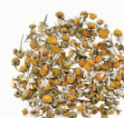
Croatian Chamomile* 克罗地亚洋甘菊茶