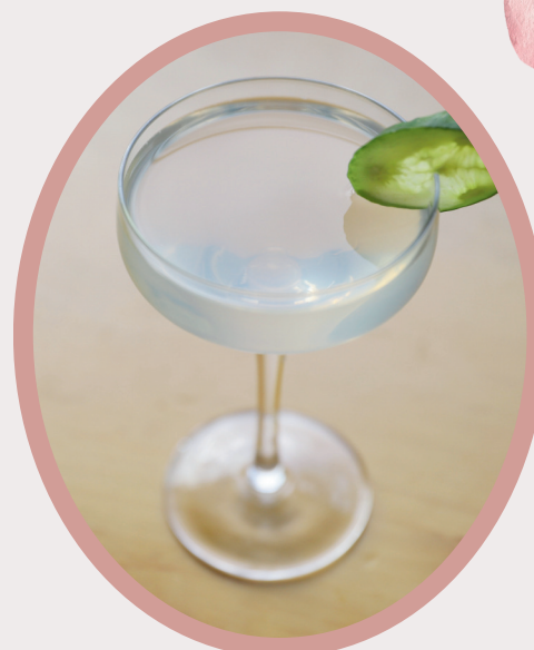
Cool & Breezy 清凉风 $14

Baijiu, Rum, Prickly Pear Lime, Cinnamon