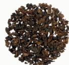
Tieguanyin Oolong 铁观音乌龙茶