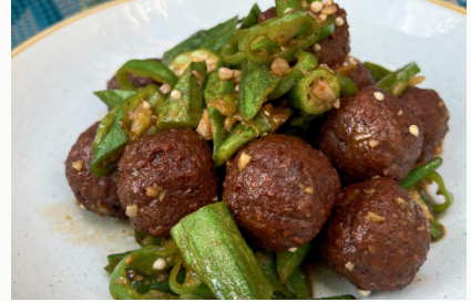
Impossible Meatball with Okra 秋葵炆烧素肉丸 $36